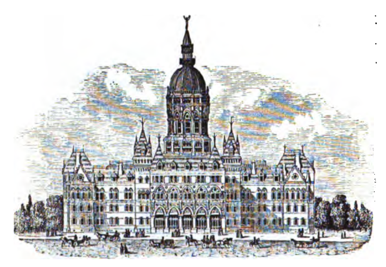
THIRD STATE-HOUSE AT HARTFORD.

Commenced in 1871; occupied in 1878; length, 206 feet; width, 190 feet; height to top of roof, 68 feet, and to top of crowning figure on the dome, 257 feet.